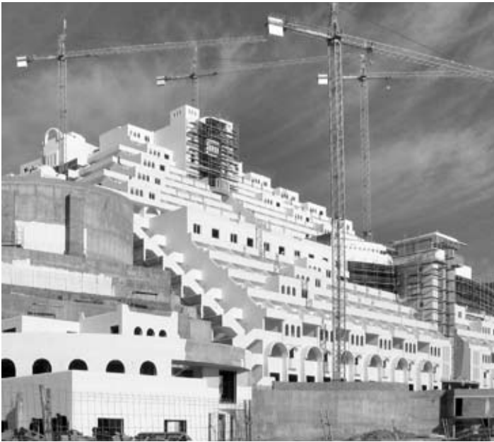
Hotel El Algarrobito, © AP

Sign and send the campaign to your frends.